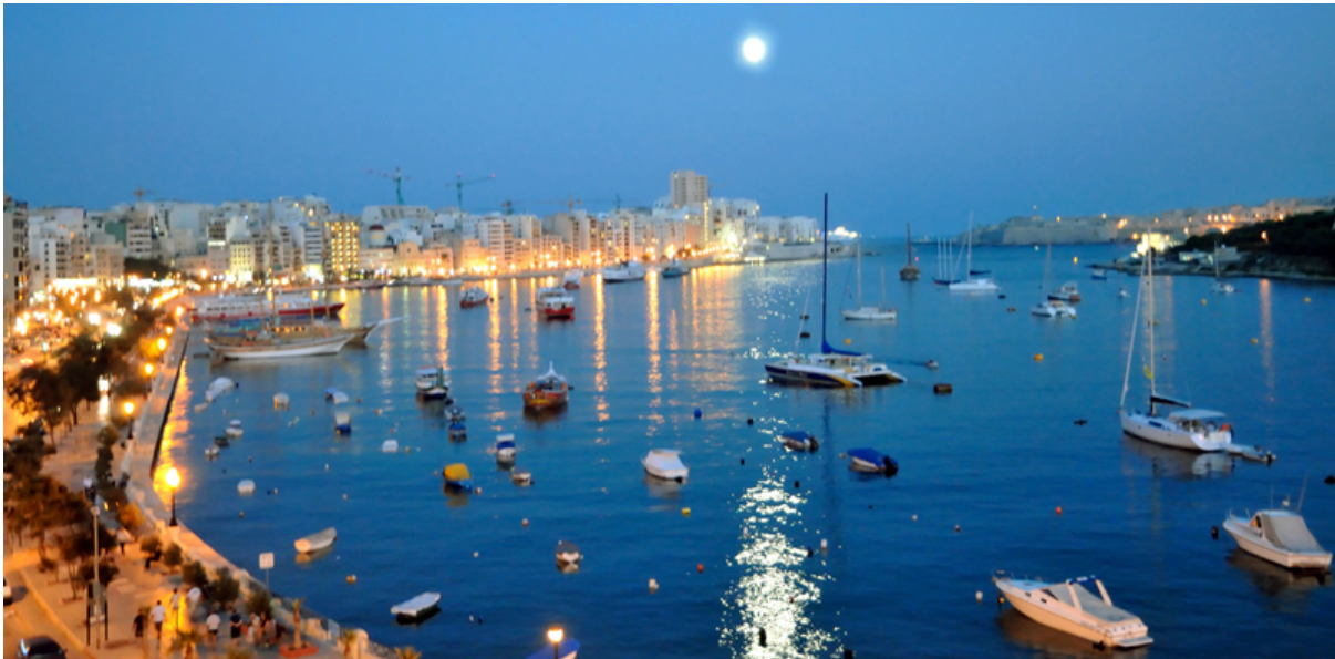
The Strand in Sliema

For further information about Malta and related tourist information, please refer to: www.visitmalta.com