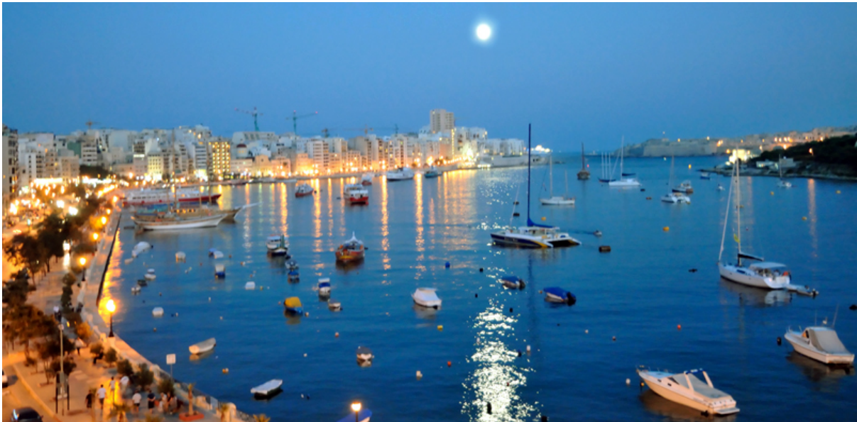
The Strand in Sliema

For further information about Malta and related tourist information, please refer to: www.visitmalta.com