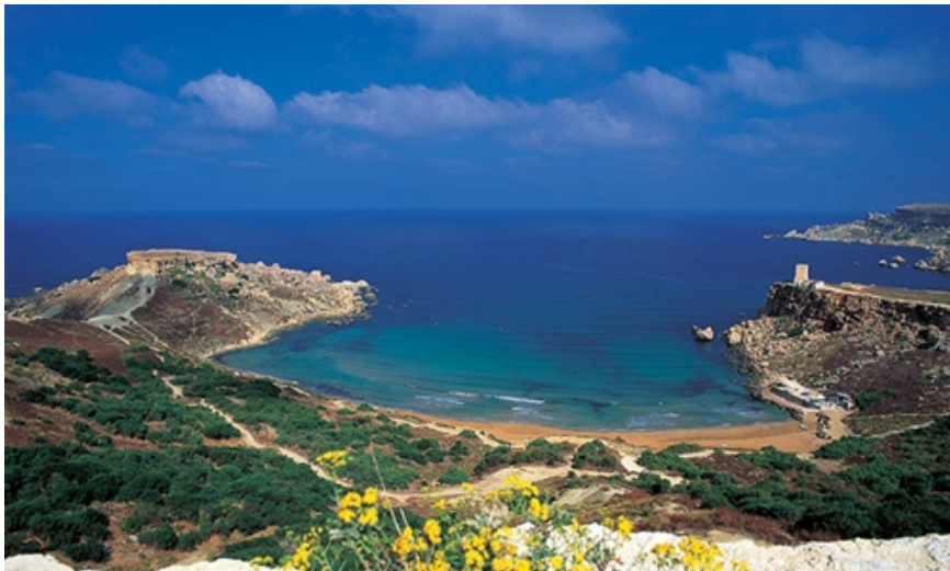
Ghajn Tuffieħa Bay

The country is a popular tourist destination with its warm climate, numerous recreational areas, and architectural and historical monuments, including nine UNESCO World Heritage Sites: Hal Saflieni Hypogeum, Valletta, and seven Megalithic Temples, which are some of the oldest free-standing structures in the world.