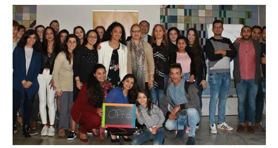
3rd Workshop, Espinho, April 2017

programme and specialized technical support, awareness raising and family and community mediation, as well as individual support and tutoring for the students.