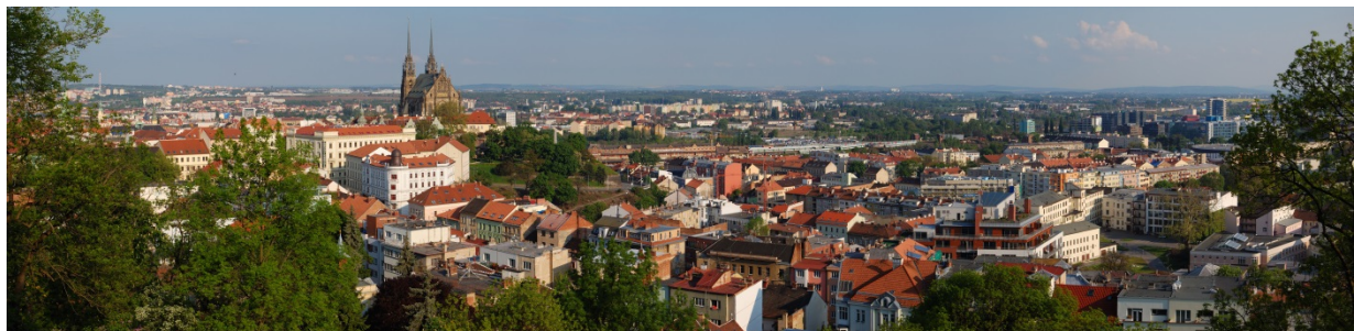
Brno view, by Petr Šmerkl

Photo 3 - https://cs.wikipedia.org/wiki/Soubor:K%C5%99tiny-kostel2013zo.jpg