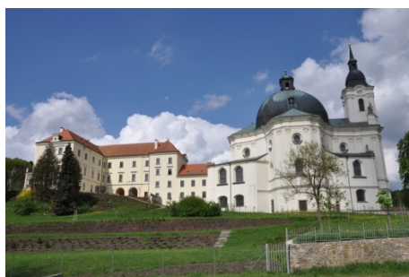
Křtiny Castel: Ben Skála

The return to Brno will be around 23.30.