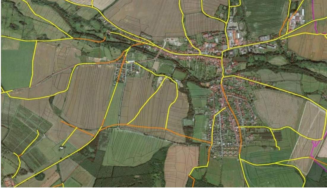
Historic roads in Spalene Porici

The Landscape plan was not placed on the back burner. At least a good part of it was incorporated in the Land Consolidation Plan. This plan became the basis for follow-up activities – for example, the renewal of the original historic road with cherry tree avenues connecting the cities of Blovice and Spalene Porici. These were created by the Toplandbrd NGO, in co-operation with local residents and students supported by the VIA Foundation. One of the attractions of this road is the Land Art construction of a brook crossing, to the Jewish cemetery near to city of Blovice.