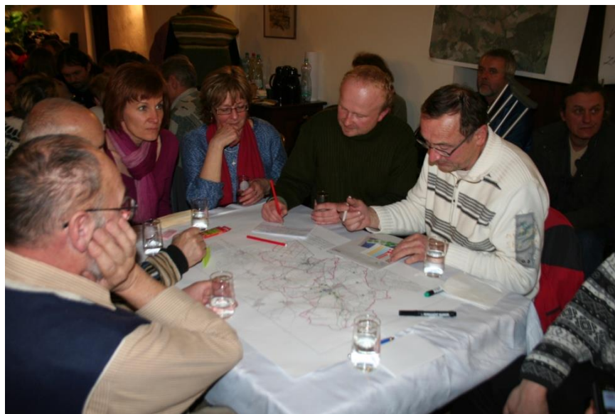
Landscape planning with local inhabitants

The main part of the project was a systematic reconnaissance of the whole area (5,000 hectares) and an understanding of the land history. We organised field trips, as many locals wanted to learn about the landscape issues.