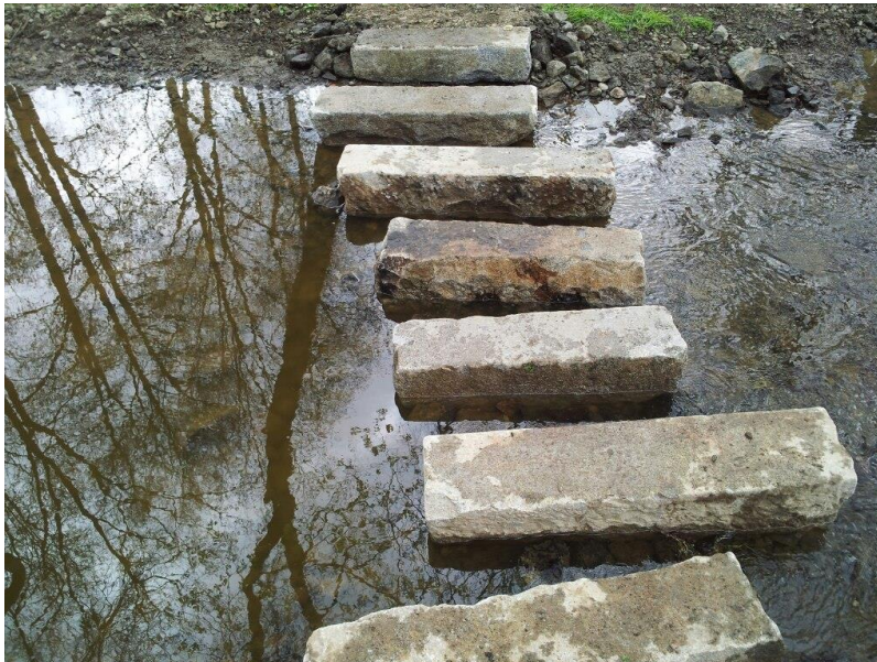
Land Art ford crossing a brook near the Jewish cemetery, near Blovice

The Landscape plan was not placed on the back burner. At least a good part of it was incorporated in the Land Consolidation Plan. This plan became the basis for follow-up activities – for example, the renewal of the original historic road with cherry tree avenues connecting the cities of Blovice and Spalene Porici. These were created by the Toplandbrd NGO, in co-operation with local residents and students supported by the VIA Foundation. One of the attractions of this road is the Land Art construction of a brook crossing, to the Jewish cemetery near to city of Blovice.