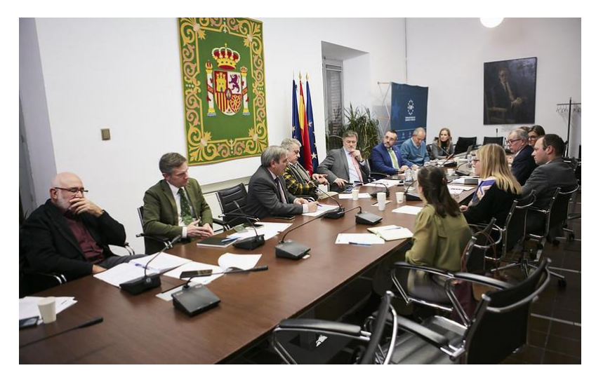
Meeting with the Director General of Legal Services and Territorial Co-ordination of the Federation of Spanish Municipalities and Provinces (FEMP)

Venue: FEMP headquarters, Villa de Madrid, Calle del Nuncio, No. 8, Madrid.