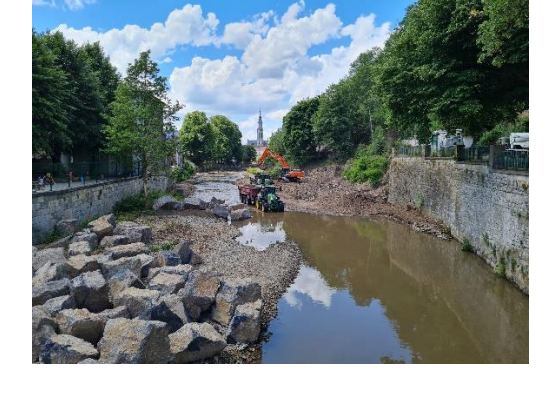
View into the Vesdre valley, Belgium