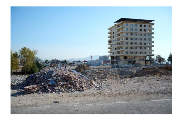
Destroyed urban areas and buildings having resisted in the area affected by the February 2023 earthquakes, Türkiye

39. According to the Union of Municipalities of Türkiye (UMT), which is the main national association of local authorities in the country, risk-preparedness had already been in the focus before the incident, including disaster-focused planning approaches, disaster risk maps, the build-up of institutional capacities and the development of spatial plans for more "disaster resistant cities". However, in the face of the sheer scale of the disaster, the capacity of these tools was overrun. Their full implementation on all territories potentially affected took a lot of time and resources. For example, the metropolitan municipality of Hatay had submitted, in 2021, its plans specifying in which urban sectors needed reinforcement to make them more earthquake-resistant, to the national Ministry of Environment, Urbanisation and Climate Change. In the face of building works to be accomplished both by public authorities and private owners, these measures could not be put into practice before the tremendous earthquake of February 2023. The reconstruction would have to take account of seismic resistance, but also foresee the human, logistic and financial resources needed to confront potential upcoming earthquakes.