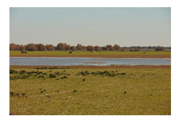
Urban and natural zones close up in Doñana National Park, Spain