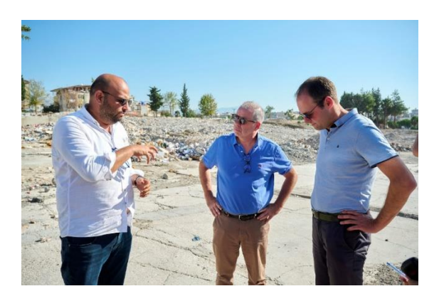
Visit of urban areas entirely destroyed by the February 2023 earthquake in Hatay, Türkiye; accompanied by municipal staff