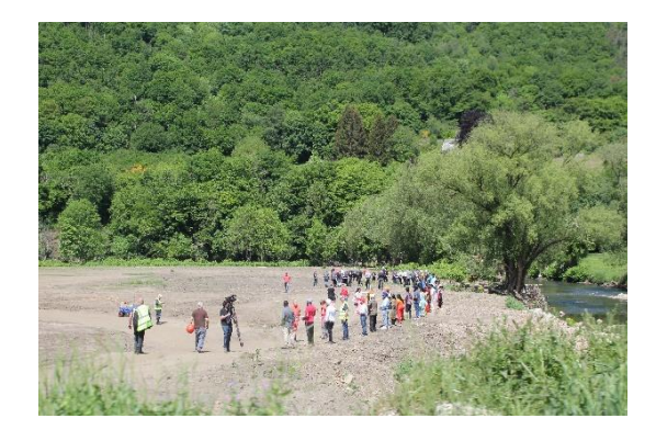
Destroyed buildings and site visit in the Vesdre valley, Belgium