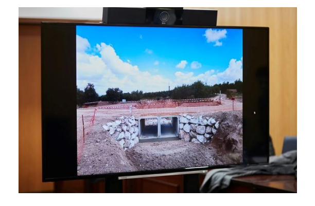
Re-dimensioning water evacuation systems in Estepa, Spain

86. A project prepared by the municipality and financed by the province at a level of 6 million euros (in line with the principle of subsidiarity and a certain degree of autonomy of the municipality), foresees that the municipality carries out the studies and implements the project, aimed at increasing the capacity of the downhill rainwater drainage network and re-orienting the water into a park where it can infiltrate the soils. Even though the project seems to be a step in the right direction, its efficiency in the light of the current effects of climate change and the intensification of events and their frequency remains to be seen. The new, enlarged pipe diametre meant to drain far more water, is based on a return period of heavy floods of 500 years, which does not correspond to the torrential rainfall experienced in recent years. If the rainfall continues to intensify in the coming years, even the extended system will no longer be able to absorb the water. Then, this project could soon be read as a technical response to a current problem, but it could already be outdated in the near future.