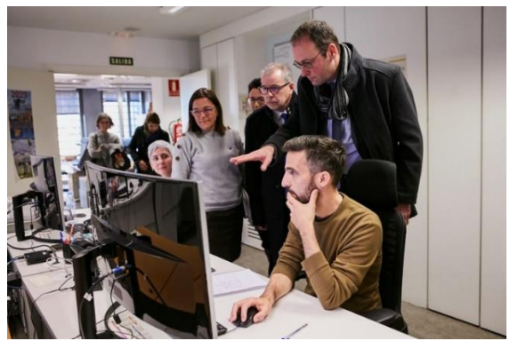
In the emergency monitoring room of the Ministry of the Interior in Madrid, Spain