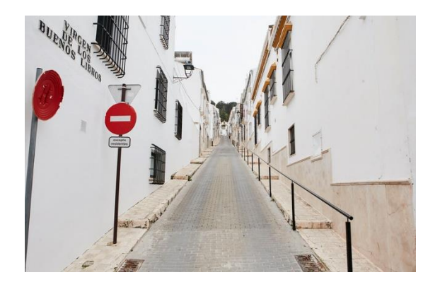
Steep slopes in Estepa, Spain

85. This is well illustrated through the example of Estepa, a small municipality near Seville, visited by the rapporteurs. This small town, built on the slope of a hill, has been suffering from the consequences of heavy torrential rains on several occasions over the last five years. The dangerous side of the phenomenon is notably the flood affecting the downhill parts of the village, where the key economic and artisanal activities are located. Moreover, due to the speed at which the run-off water descends the streets of the town, houses and infrastructures are regularly damaged, networks foreseen for discharging water are saturated and the water levels increase quickly according to a phenomenon called the "bathtub", where the evacuation is only possible if the entry points are fare above the exit points of the waters.