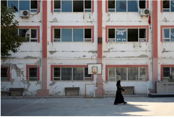
Destroyed houses and school in the earthquake affected area in Türkiye