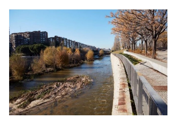
Visit to the re-naturalisation projects on Rio Manzanares, Madrid, Spain

120. Adaptation strategies must be prepared and implemented at all territorial levels, addressing challenges such as economic and real estate development pressures in cities. Finding new spaces in urban structures to support socio-economic and ecological transitions is a complex challenge, exemplified by the transformation of Madrid's Manzanares river.<sup>35</sup> This case illustrates the need to rethink the place of car mobility in modern cities and its impact on open and natural spaces. Working on risk reduction involves developing synergies and common strategies, encompassing socio-economic, ecological, and climatic transitions.